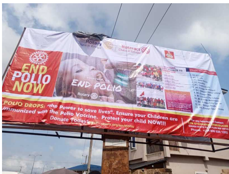
Enugu Rotaract commissioned a World Polio Day 2025 billboard to keep the End Polio Now message visible and loud.