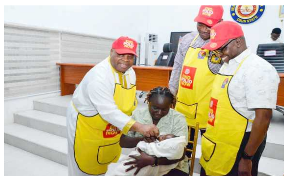
His Excellency Ademola Adeleke, Executive Governor of Osun State, leads by example by vaccinating a child and reaffirming the importance of immunization.