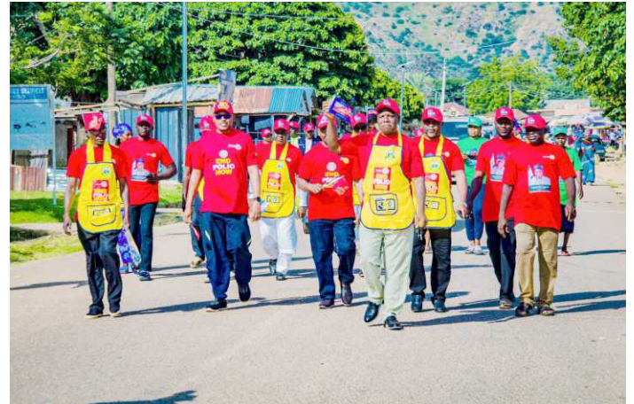
Gombe State Local Government Chairmen walking against polio to celebrate world polio day