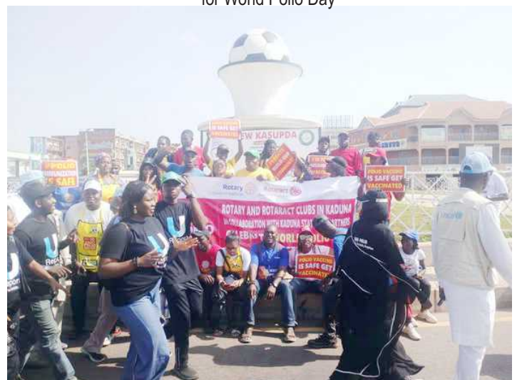
Rotary Clubs in Kaduna, alongside amazing partners, hit the streets for a colorful End Polio Now Walk.