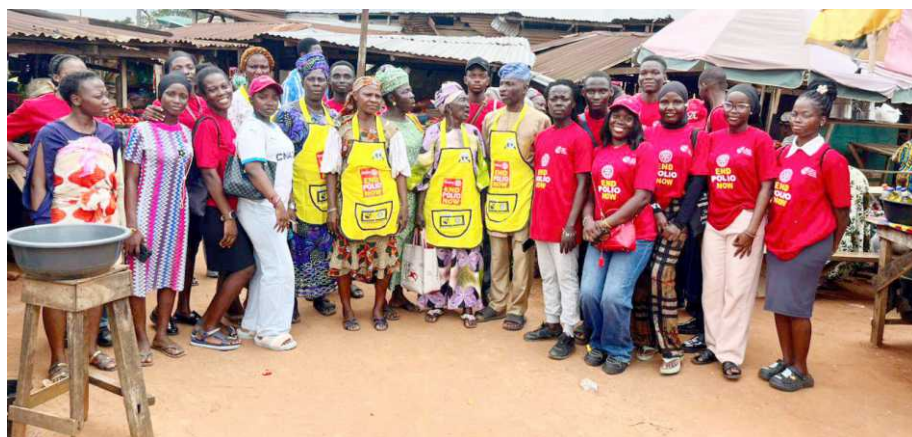
Rotaract District 9112 Holds Market End Polio Awareness Drive in Ilisan Community, Ogun State