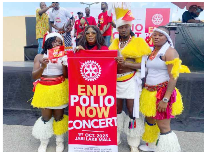
To celebrate World polio day Rotary Club of Wuse Central organized 5K End Polio Concert at Jabi Lake Mall, Wuse Central, Abuja