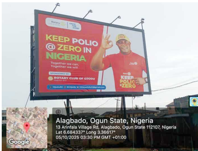
Alagbado, Ogun State, Nigeria 13 Arinfala Village Rd, Alagbado, Ogun State 112107, Nigeria Lat 6.684337° Long 3.36617° 05/10/2025 03:30 PM GMT +01:00