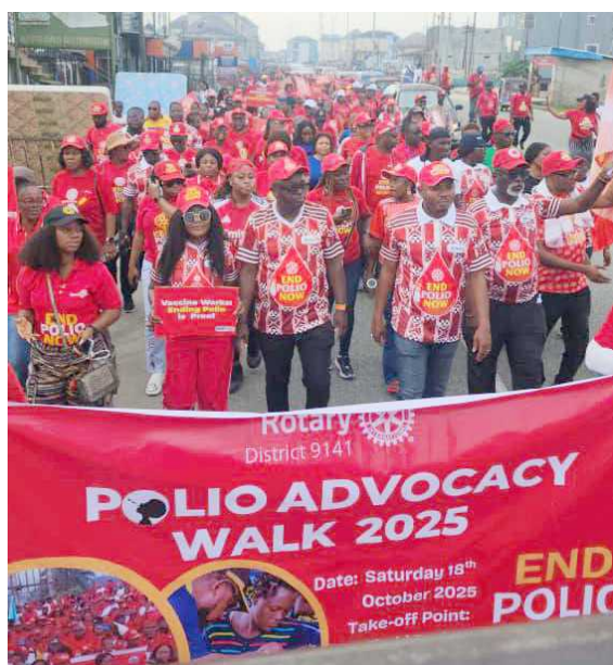
District 9141 Polio walk awareness in Yenagoa