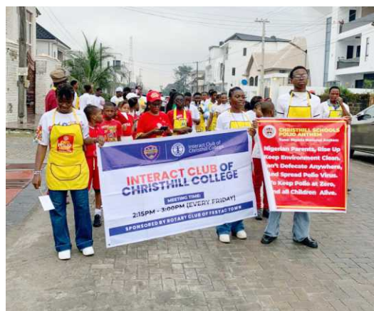
Young voices, big impact! The Interact Club of Christ Hill College hit the streets with an End Polio Now Awareness Walk to celebrate World Polio Day.