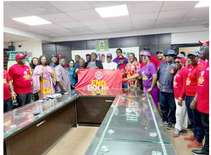
NNPPC Members and Rotary International Polio Ambassador Sir Emeka Offor's visit to Hon. Minister of Health Muhammad Ali Pate for World Polio Day