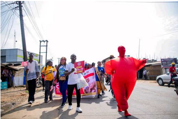
The World Polio Day awareness walk in Akwa Ibom echoed a powerful message across the community, polio eradication is possible.