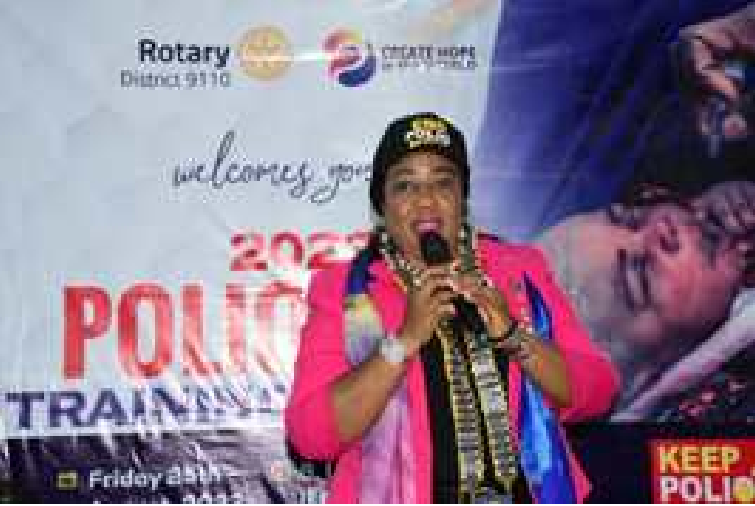
District Governor Ifeyinwa Rita Ejezie at the Seminar

The Nigeria National PolioPlus Committee of Rotary International recently organized a Polio Seminar to update the knowledge of Rotarians on current efforts in the polio eradication initiative and to help them become more effective in supporting the polio eradication effort going forward. The seminar took place on 23 August 2023 at the Rotary Center in Ikeja under the auspices of the Nigeria National PolioPlus Committee and the 2023 PolioPlus Committee of Rotary District 9110.