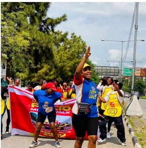
Rotarians in Calabar, Cross River, marches to Commemorate World Polio Day