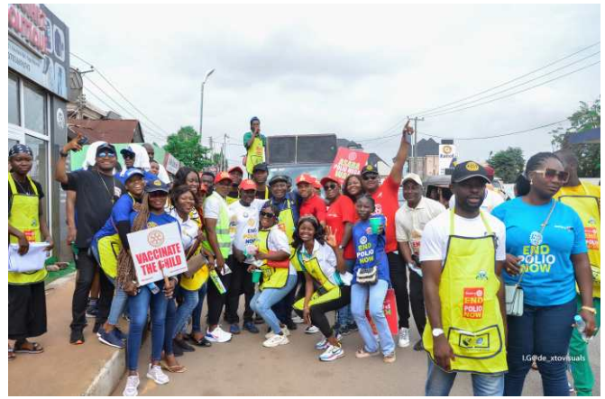
Asaba's Rotarians took to the streets en masse