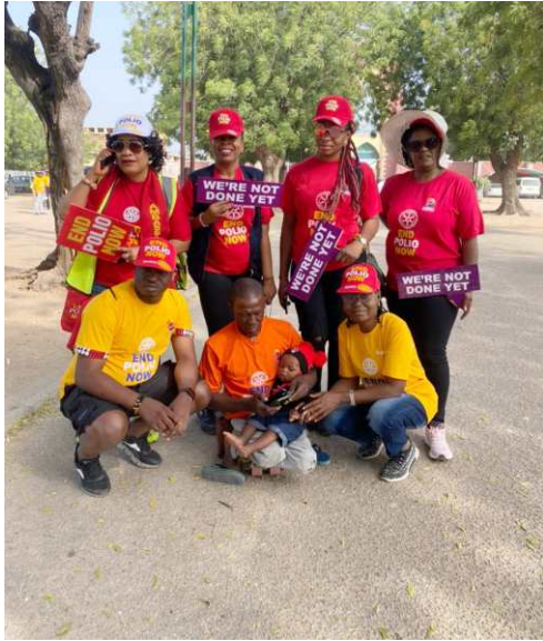
Some Rotarians posed with a polio survivor and his baby in Kano