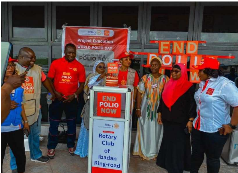
Rotary Club of Ibadan Ring-Road marks the 2023 World Polio Day with a significant project – placing a polio donation box at Ibadan Airport Alakia, contributing to the global effort to eradicate polio