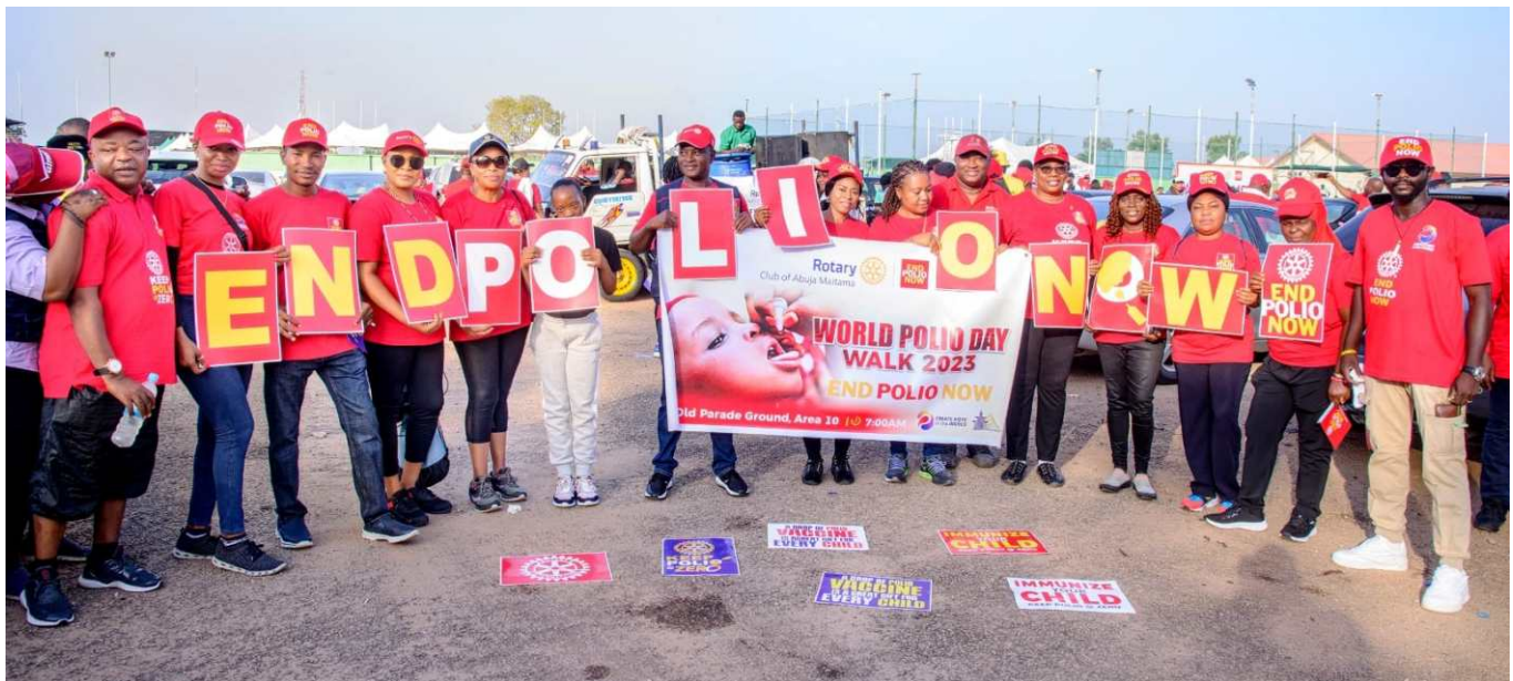
R.C. Maitama, Abuja celebrating WPD