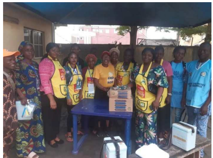
The Rotary Club of VGC, Eti-Osa East, D9110, was actively involved in supporting the community through the provision of pluses and supervision of immunization exercise.