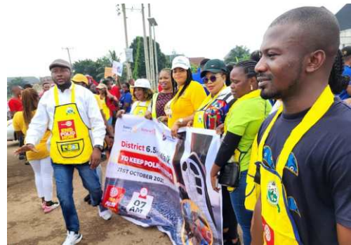
Rotarians walking for Polio Eradication in Awka