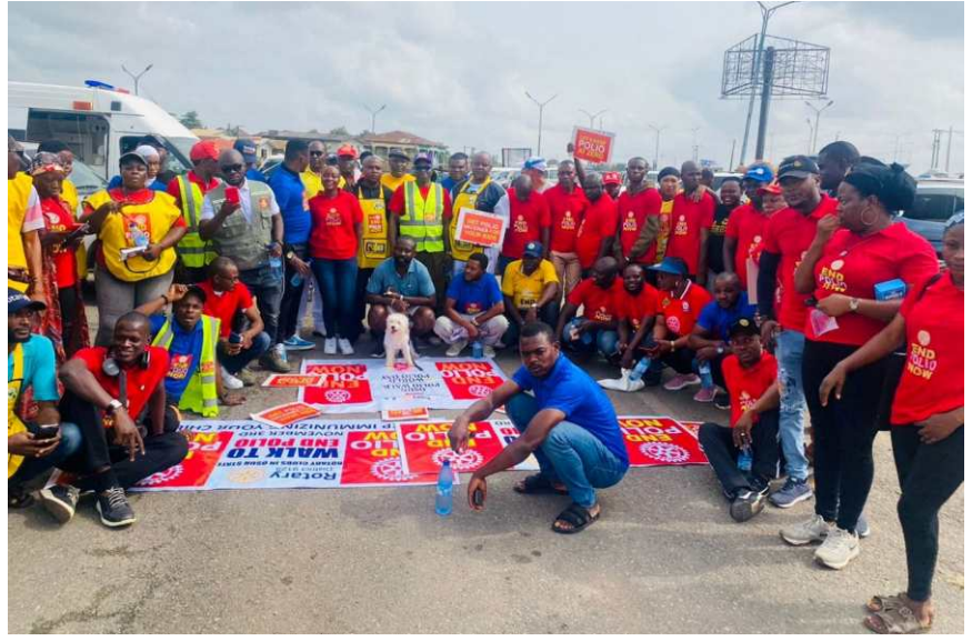
All Rotary clubs in Osun state Spreading the spirit of WorldPolioDay in Osogbo