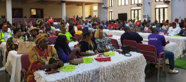
Cross Section of Rotarians at the Seminar in Awka