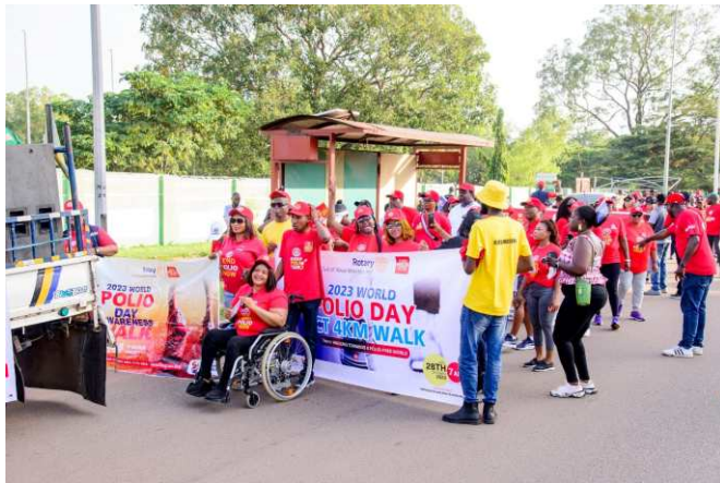
Polio rally by Abuja Rotarians