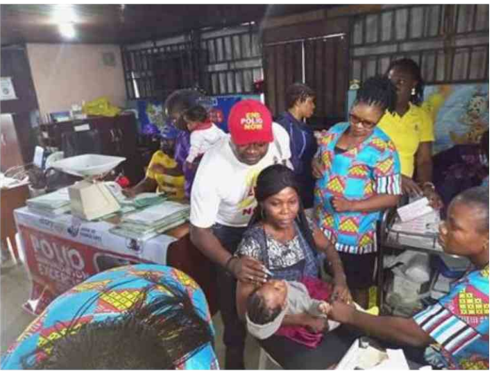
On 23 October 2021, RC of Port Harcourt North. carried out a 2 day polio project; an immunisation exercise at Rumukurushi Model Health Centre, (b) A gala night to raise money for polio funds.