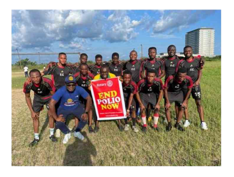
On 24 October 2021. RC of Ox-Bow Lake. Yenagoa, had a Novelty match to Celebrate World Polio Day, between Rotarians/Rotaractors and Yenagoa All Star.