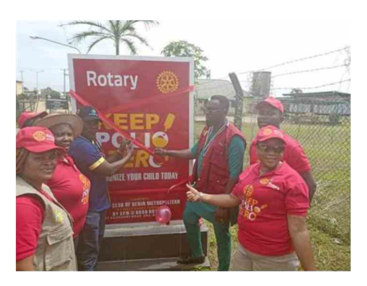
On 30 May 2022, Benin Metropolitan, Erected "keep polio @ zero" signpost to create awareness on the need of continuous immunization.