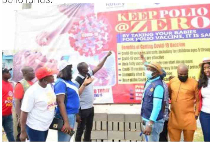
On 30 November 2021, RC of Sapele Gateway. installed and commissioned an End Polio /COVID-19 bill board to sensitize the public. These are just a few of the many wonderful activities and projects carried out in support of Polio Eradication in our district during this highly impactful Rotary year.

I wish to use this opportunity to thank all Rotarians in District 9141 who came out to perform this humanitarian duty and our district leaders for demonstrating exemplary leadership qualities. I equally appreciate all our State and Club Coordinators for a job well done.