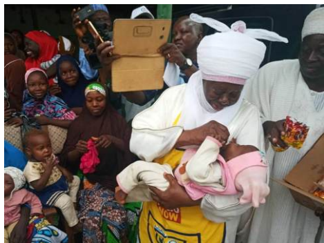
Emir of Kaltungo, Gombe State vaccinating a child during the Flag Off ceremony