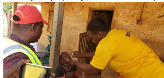
Rotarians vaccinating children in Akanbi Ward of Ilorin South LGA.