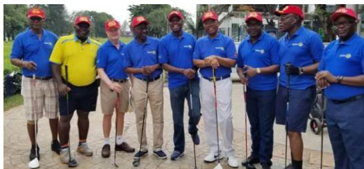
District 9110, Nigeria organised a Golf Kitty Tournament amongst the District Leaders who are Golfers_ to support POLIO ERADICATION.