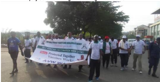
The 2019 Africa Vaccination Week (AVW) was launched with an AWARENESS WALK sponsored by NPHCDA & other partners