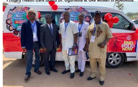
Rotarians posing with the DRINK A BOTTLE TO END POLIO fund-raising initiative by Rotary Cluc of Ogba, RID9110