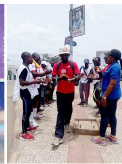
Members of the Red Cross and some Rotarians cheering up Rotn. Terna