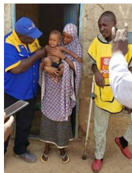
A child who was finally vaccinated after convincing the Father on the NEED TO IMMUNIZE EVERY CHILD.