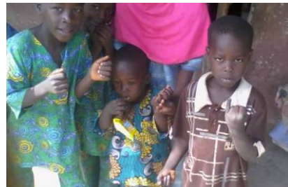
Vaccinated Children pose for a picture to display that they have been immunised.