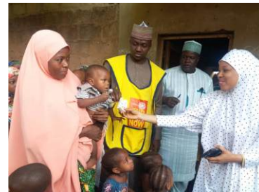
A Vaccinator handing over - PLUSes - to a child after he was vaccinated.