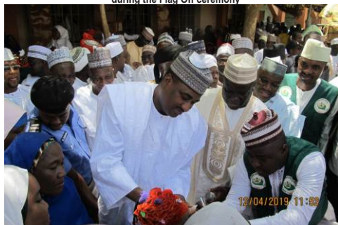
The symbolic immunization exercise done by the Sokoto State Deputy Governor during the State flag-off at Illela LGA