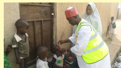
HRH Ndanusa Yunusa Yakubu PAG (Sarkin Nupawan Katsina ) Vice Chairman (North)

5. With regards to widescale dilapidation and breakdown of equipment, machinery and tools involved in the polio eradication process, the Rotary clubs in Nigeria should also lead wide awareness building for responsive donations and interventions and also mobilize the entire Rotary family for the donation of modern equipment to support health care at all levels but especially at the primary level of care. The clubs, through their District Governors, may also consider creating more intensive emphasis in promoting and supporting infant and young child feeding, prevention of malaria, post natal care, intrapartum care, immunization as well as water/sanitation and hygiene especially in special domains of observed deficits.