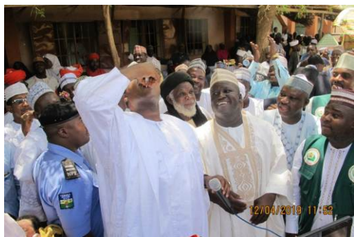
At State flag-off of the April Round of SIPDS, the Deputy Governor of Sokoto State drops few vaccines in to his mouth