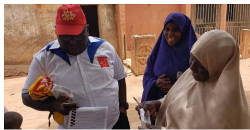
Rotary Field Coordinator assisting Team Supervisors with the OBR tally-sheet..