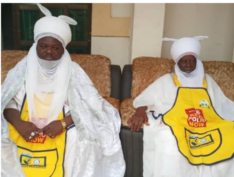
Left - Emir of Balawaja Balanga and Emir of Kaltungo (right) during the 3rd Phase of Outbreak Response