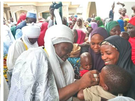
The Emir of Balawaja Balanga Gombe State immunising children during the Flag Off