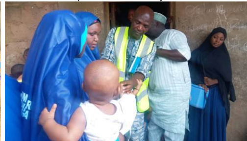
Teams of vaccinators in SOKOTO STATE during the April round (Phase 1) of the SIPDS